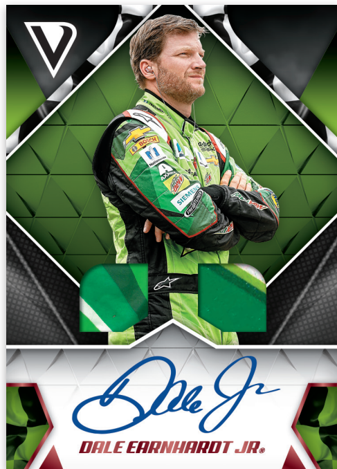
DUAL SWATCH SIGNATURES