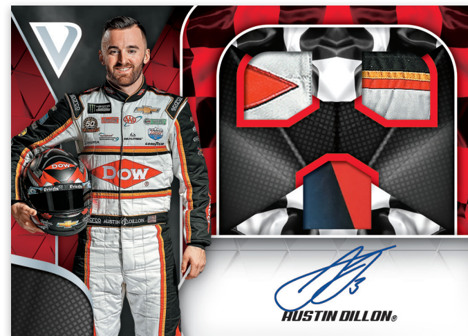
TRIPLE SWATCH SIGNATURES

Whether it's one, two or three swatches Signature Swatches is full of race-used memorabilia paired with an autograph! Each set has the following parallels: