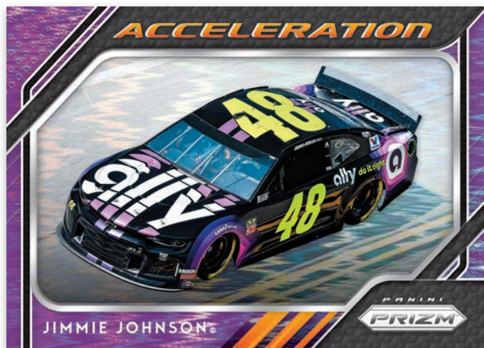
ACCELERATION PURPLE FLASH PRIZM (HOBBY-EXCLUSIVE PARALLEL)