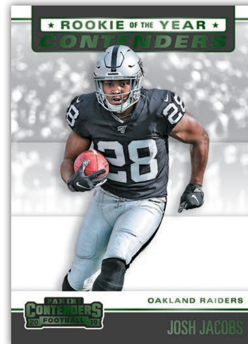
ROOKIE OF THE YEAR CONTENDERS EMERALD

Look for this insert, featuring 20 heavyweights for the NFL MVP Award.