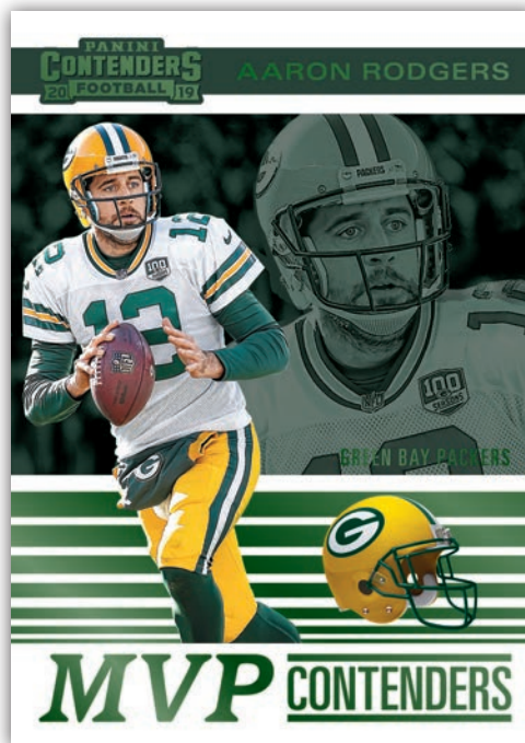
MVP CONTENDERS EMERALD

Look for the retail-exclusive emerald parallels of inserts, including Round Numbers, Winning Ticket, Legendary Contenders, MVP Contenders and Rookie of the Year Contenders.