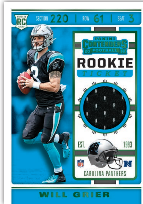
ROOKIE TICKET SWATCHES VARIATION

340-card base set includes Season Tickets, Rookie Tickets, and Rookie Ticket Variations.