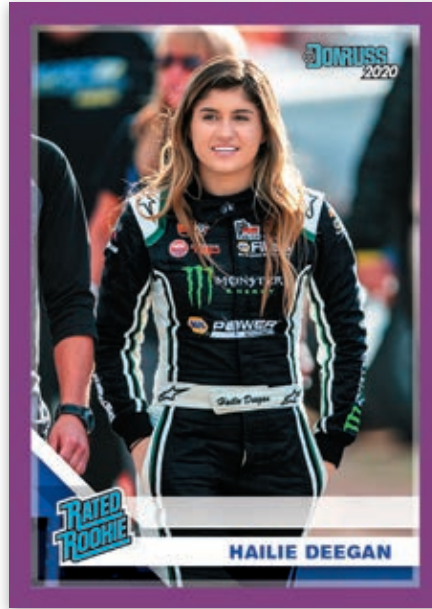
RATED ROOKIES PURPLE