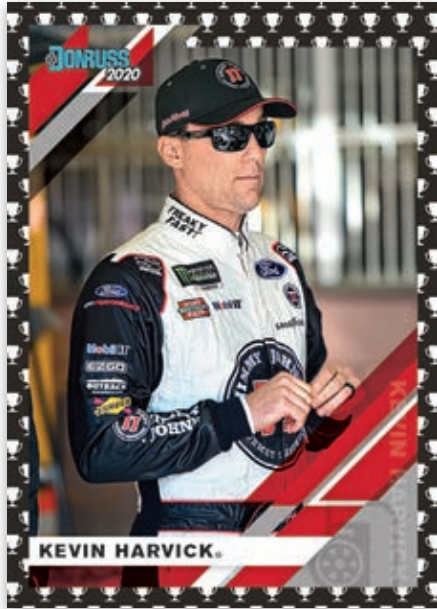
BASE BLACK TROPHY CLUB