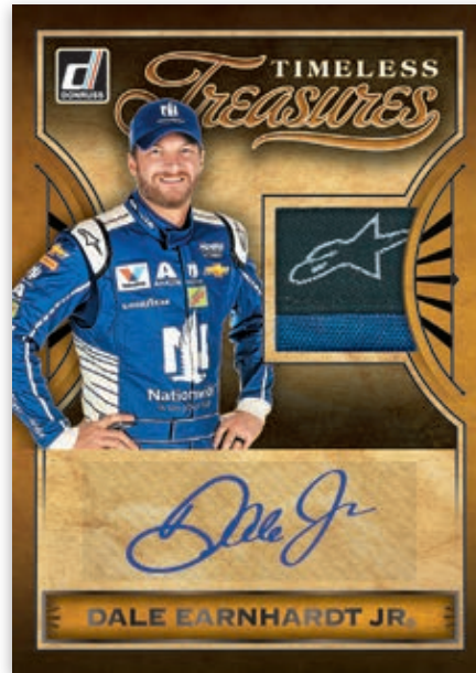
TIMELESS TREASURES MATERIALS SIGNATURES BLACK

Signature Series features a variety of current and retired legend drivers on a new design for 2020! Look for 3 foil parallels, including Red, Gold and Black.