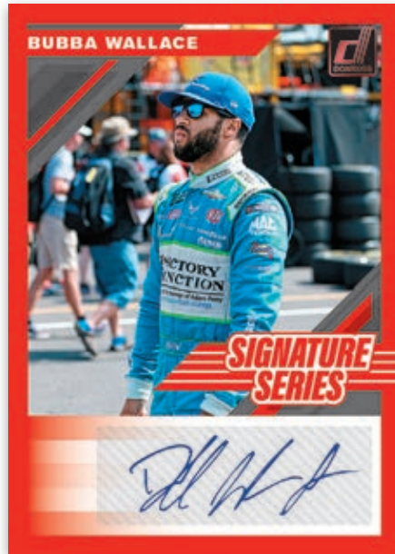
SIGNATURE SERIES RED

Signature Series features a variety of current and retired legend drivers on a new design for 2020! Look for 3 foil parallels, including Red, Gold and Black.