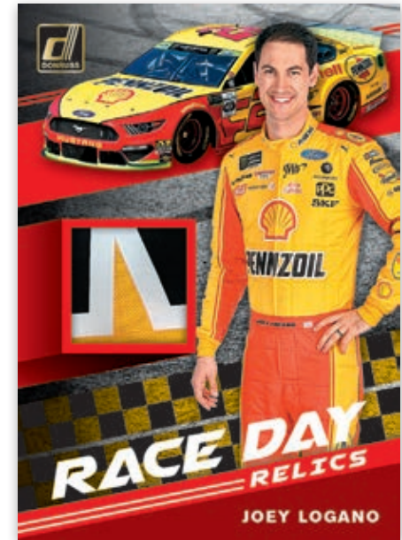
RACE DAY RELICS GOLD

NEW for 2020: Timeless Treasures Materials Signatures features a throwback-styled design and a who's who checklist! This insert features an autograph paired with a swatch of material. Look for 3 foiled parallels, including Red, Gold and Black.