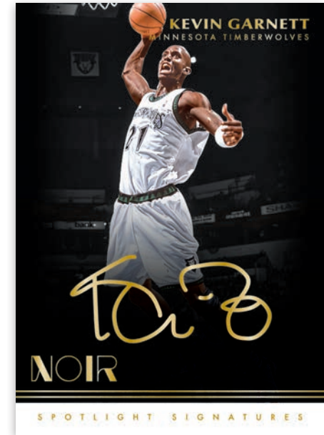
SPOTLIGHT SIGNATURES VERTICAL

Noir presents some of the most unique Autograph sets of the release year! Collect your favorite players in Spotlight Signatures and Sneaker Spotlight Autographs!