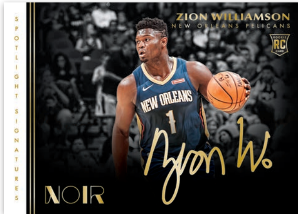
SPOTLIGHT SIGNATURES HORIZONTAL