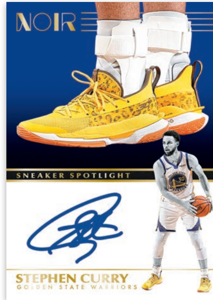
SNEAKER SPOTLIGHT SIGNATURES