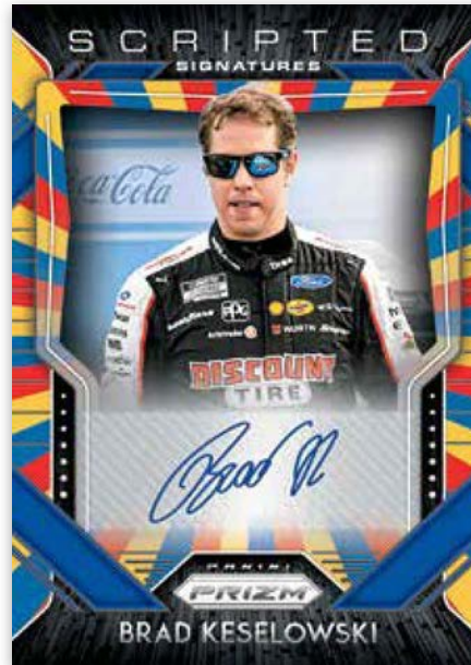
SCRIPTED SIGNATURES RAINBOW PRIZM