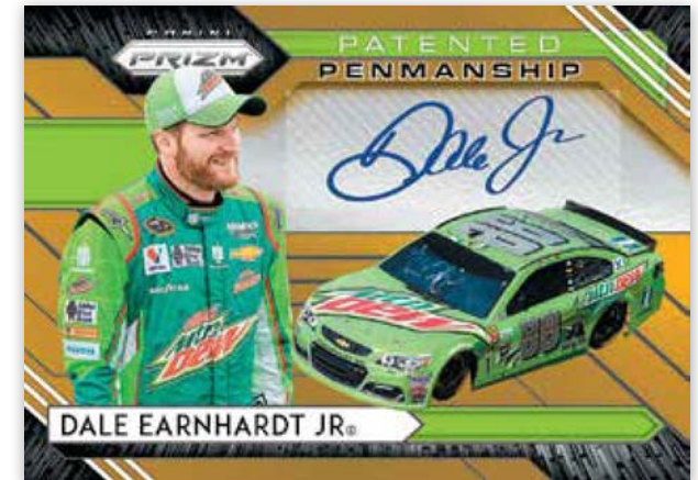
PATENTED PENMANSHIP GOLD PRIZM

With four different autograph sets, look for autographs from your favorite drivers in Endorsements, Scripted Signatures, Patented Penmanship and Signing Sessions!