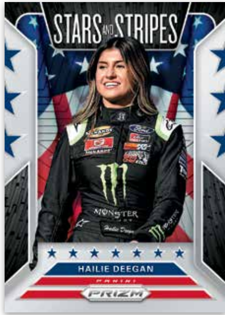
STARS AND STRIPES PRIZM