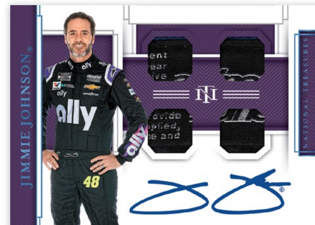
QUAD RACE GEAR GRAPHS HOLO PLATINUM BLUE

2020 National Treasures racing will feature multi-swatch cards, featuring up to four pieces of race-used material, including signed versions!