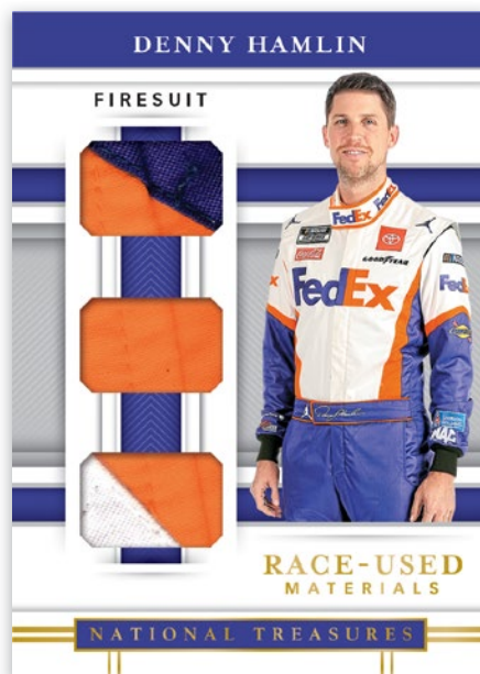
TRIPLE RACE USED FIRESUITS FIRESUITS PRIME