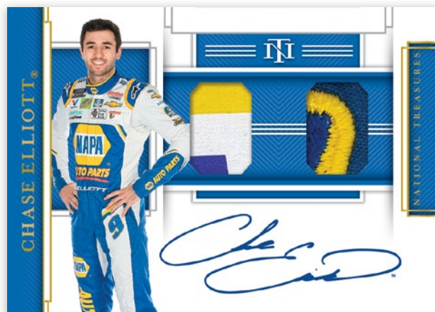
DUAL RACE GEAR GRAPHS HOLO GOLD