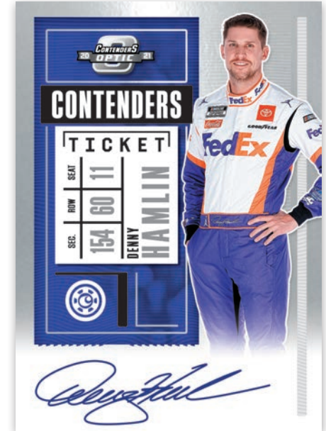
Card images are solely for the purpose of design display.