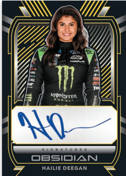
Card images are solely for the purpose of design display.