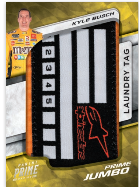
Card images are solely for the purpose of design display.

Jet Black Materials features two swatches of race-used memorabilia for numerous fan-favorite drivers!