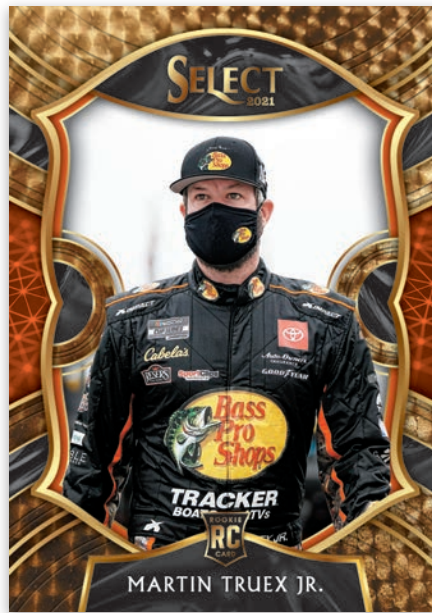
Card images are solely for the purpose of design display.