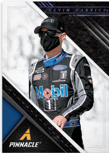
Card images are solely for the purpose of design display.