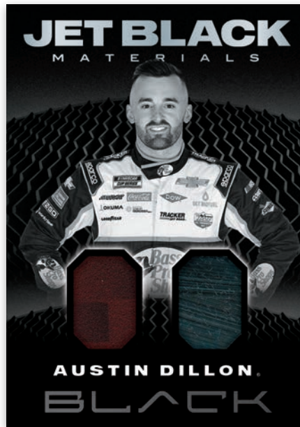
Card images are solely for the purpose of design display.

Chronicles Swatches showcases the various race used materials for drivers, including Sheet Metal, Tires, Fire Suits and Gloves. Look for 5 parallels #’d/49 or less.