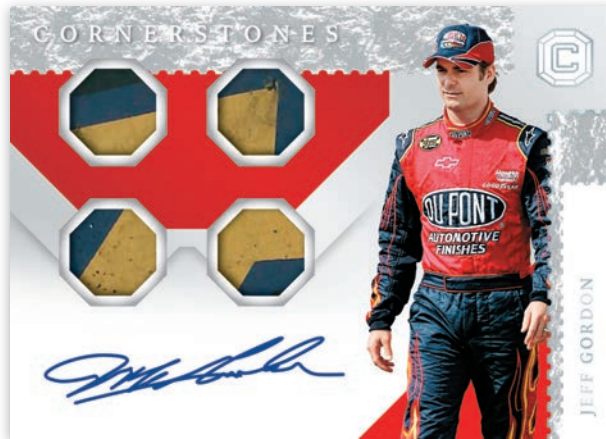
Card images are solely for the purpose of design display.