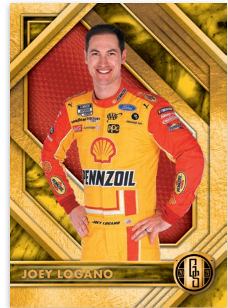
Card images are solely for the purpose of design display.